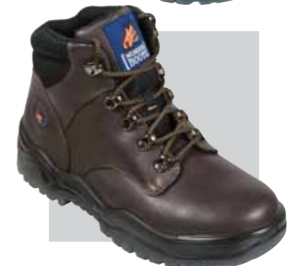
917030 Claret Kip Lace-up Boot TPU/PU Toughsider sole Speed lacing D rings Airzone comfort system OrthoTec PU innersole Fully lined Padded tongue and collar Sizes 3-14 (6.5 -10.5)