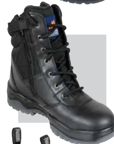
951020 Black Highleg Boot TPU/PU Toughsider sole ZipSider style Airzone comfort system OrthoTec PU innersole Fully lined Padded tongue and collar Sizes 5-14 (6.5 -10.5)