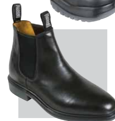
805025 Black Riding Boot TPU/PU sole OrthoTec PU innersole Rigid instep shank for horse riding Sizes 4-13