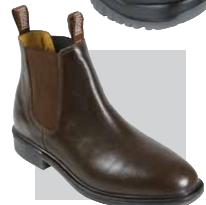
805070 Brown Riding Boot TPU/PU sole OrthoTec PU innersole Rigid instep shank for horse riding Sizes 4-13