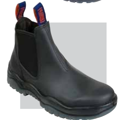
916020 Black Kip Elastic Sided Boot TPU/PU Toughsider sole Airzone comfort system OrthoTec PU innersole Sizes 5-14 (6.5 -10)