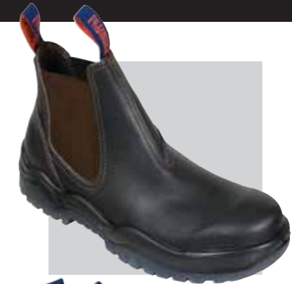
916030 Brown Kip Elastic Sided Boot TPU/PU Toughsider sole Airzone comfort system OrthoTec PU innersole Sizes 5-14 (6.5 -10)