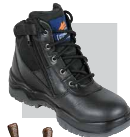
961020 Black Kip Boot TPU/PU Toughsider sole ZipSider style Airzone comfort system OrthoTec PU innersole Fully lined Padded tongue and collar Sizes 5-14 (6.5 -10.5)