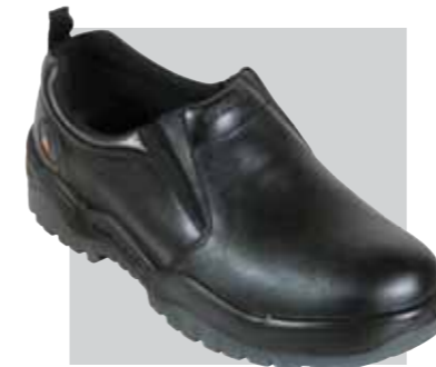
915025 Black Slip on Shoe TPU/PU Toughsider sole Airzone comfort system OrthoTec PU innersole Padded collar Sizes 3-14 (6.5 -10.5)