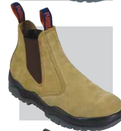
916040 Wheat Elastic Sided Boot TPU/PU Toughsider sole Airzone comfort system OrthoTec PU Air innersole Sizes 5-14 (6.5 -10.5)