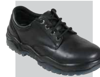
910025 Black Derby Shoe TPU/PU Toughsider sole Airzone comfort system OrthoTec PU AIR innersole Padded collar Sizes 3-14 (6.5 -10.5) • Available in women's fittings